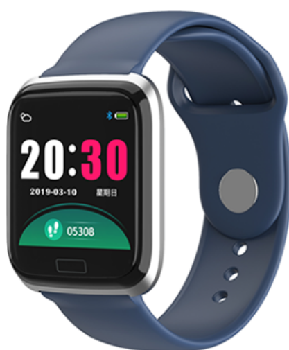
SILVER BLUE SW-B3-BLUE-S