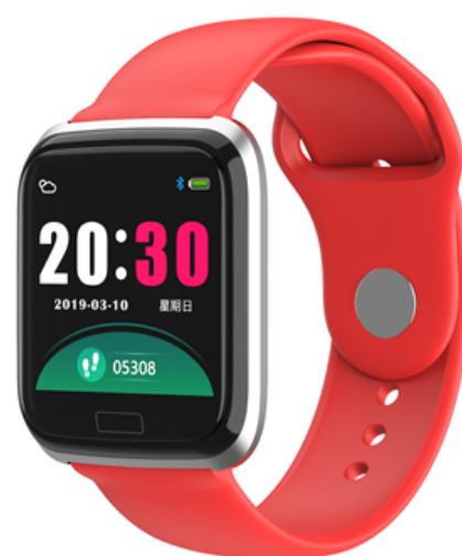
SILVER RED SW-B3-RED-S