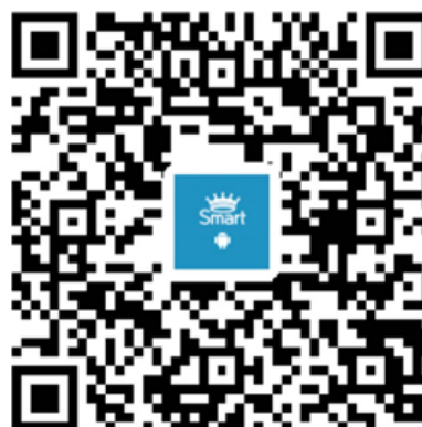
Google Play APP