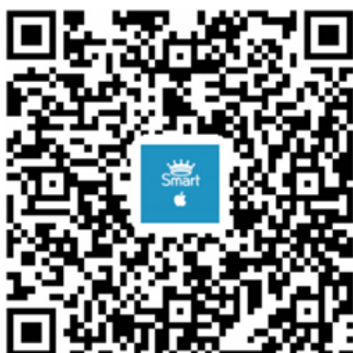
Apple Store iOS APP

In the Apple Store and Google Play search "Smart King" to download and install, or scan the code QR to take you to the direct link for the download of the APP: