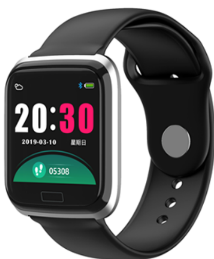
SILVER BLACK SW-B3-BLACK-S